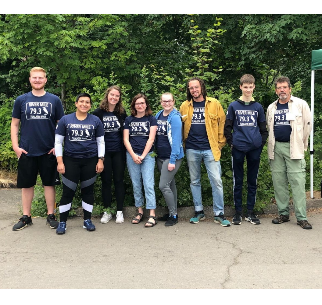
2019 ANNUAL REPORT